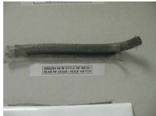
6000264 - RF GASKET TADPOLE S/S 1/2" x 3/4" - CURRENT