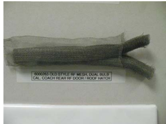
6000263 - RF GASKET TADPLE MESH 2 BULB 5/8" - OBSOLETE