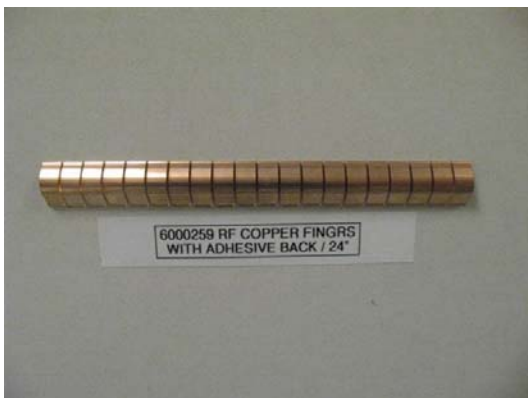
6000259 - RF GASKET COPPER STICK ON FINGERS 24" For Bottom of RF Door Current Production.