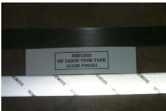
4001203 - RF DOOR TRIM TAPE - ALUM FINISH