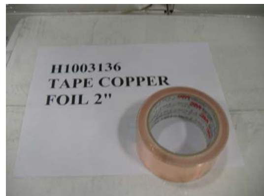
H1003136 – Copper Foil Tape