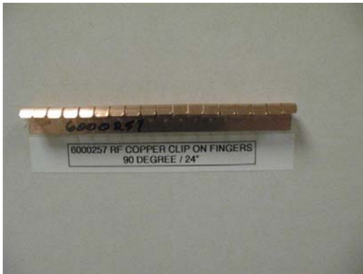
6000257 - RF GASKET COPPER SCREW ON 90DEG FINGERS – Calumet Coach Era