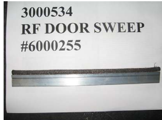
3000534 – RF Door Sweep For Bottom of RF Door – Calumet Coach Era.