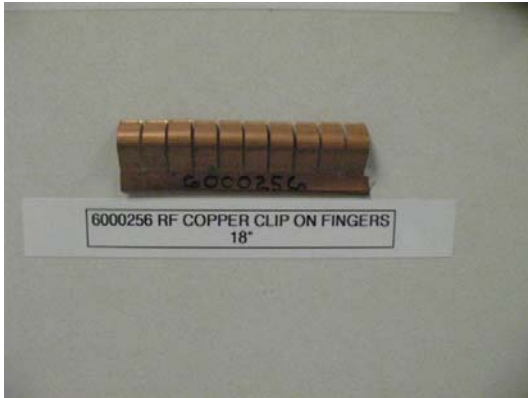
6000256 - RF GASKET COPPER CLIP ON FINGERS For The Sides And Top of RF Door