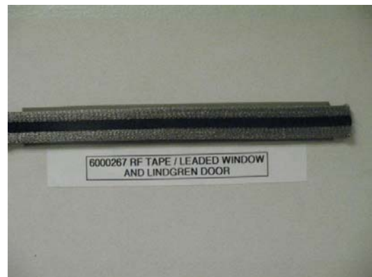
6000267 - RF GASKET RAILROAD WITH ADHESIVE 25 For Leaded Glass