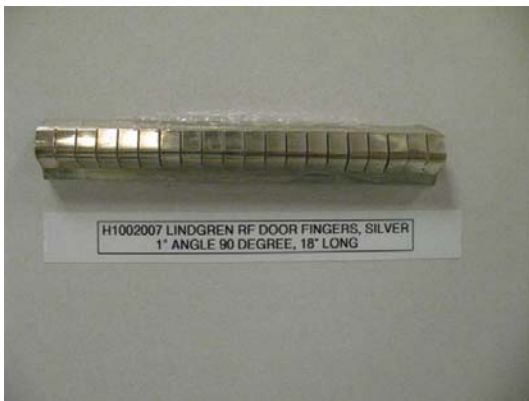
H1002007 - RF FINGERS 1" ANGL 90 DEGREE